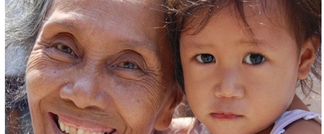
You provided Bibles and bags of rice to this girl and her grandmother, as well as hundreds of other families affected by recent typhoons.