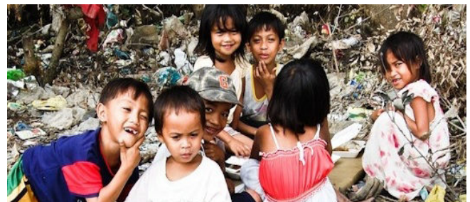
You provided warm meals for these children at the Wawa dump site.